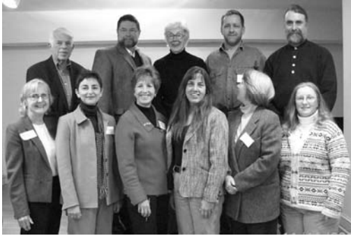
2007 and 2008 Board Members